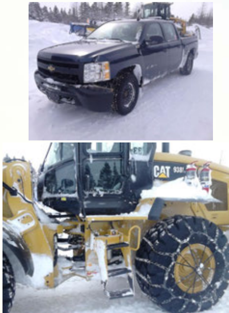
Metal on Metal